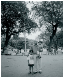
Sunday Afternoon, 1999 Sunday Afternoon series, 1999-2000