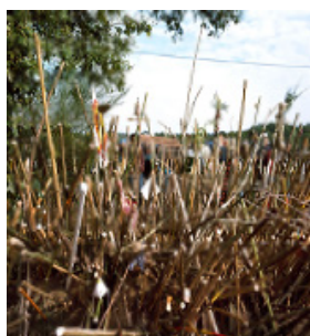
« Our sacred land », the sticks filed next to Bellevue farm, ZAD of Notre-Dame-des-Landes, Sturday 8 october 2016 Notre-Dame-des-Landes series, 2015 - ongoing Private collection, Paris