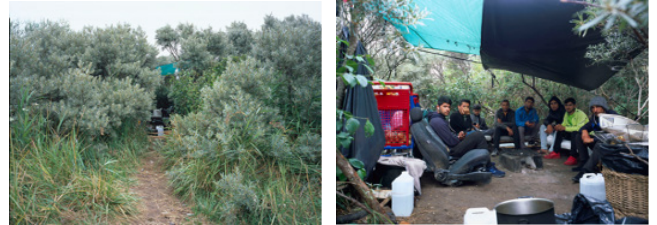
Afghan refugees' camp in a wasteland close to the hospital, Calais, 16 July 2020 Calais series, 2006-2020 Production Frac Île-de-France, Paris