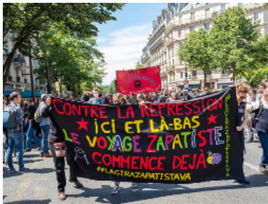
Pour la vie (For Life), 2021 Production Frac Île-de-France, Paris