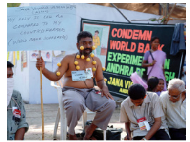
Condemn World Bank, WSF Mumbai, 2004 World Social Forum series, Mumbai, 2004 Courtesy the artist and galerie Air de Paris, Romainville