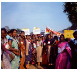
Judge Not, Support Sexual Preference, World Social Forum, Mumbai, 2004 World Social Forum series, Mumbai, 2004 Courtesy the artist and galerie Baronian Xippas, Paris-Brussels