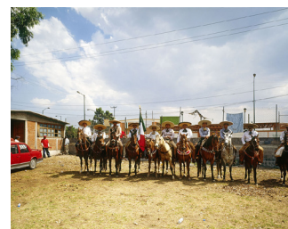
Vendredi 28 avril 2006. Delegate Zero's guard. Lienzo Charro Los Reyes FPFUI-UNOPII, Iztapalapa Courtesy the artist and galerie Baronian Xippas, Paris-Brussels