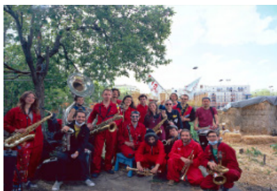
The climate brass band playing to support the occupancy of the Jardins Ouvriers des Vertus (community gardens) in Aubervilliers threatened with destruction to allow the building of a swimming pool for the Olympic Games in Paris 2024, Aubervilliers, 8 May 2021

Production Frac Île-de-France, Paris