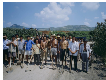
Group (roadmenders and villagers), 12.08.2004 Work group series, 2004

Production Frac Île-de-France, Paris